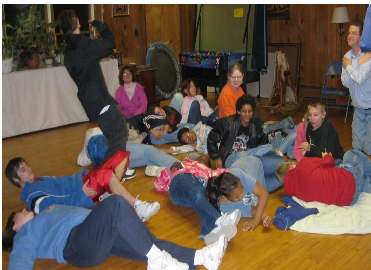
Deaf Teen Fellowship Staunton ,VA

We give thanks that the Spirit can use those adolescent hormones for God's purposes! Please join us in praying that God will lead us as we continue to share with these wonderful teens!