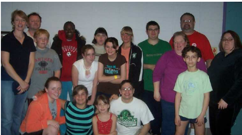
Indiana Deaf Teen Nite Group 3/26/06